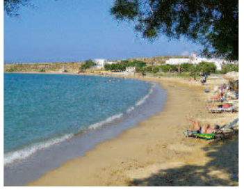
Agii Anargyri Beach