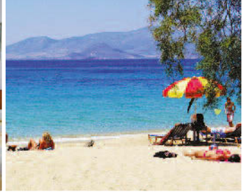
Aghios Prokopios beach